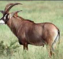
* Roan Antelope U$ 7,500