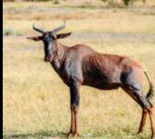
*Tsessebe U$ 3,950