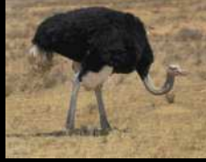
*Ostrich U$ 550