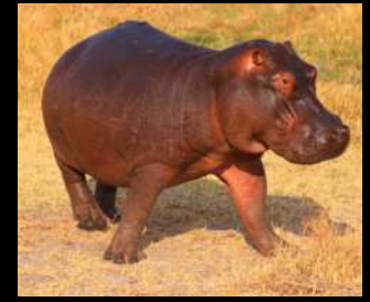
Hippo U$ 9,500