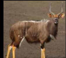
*Nyala U$ 3,250