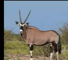
*Oryx U$ 950