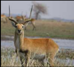
Red Lechwe U$ 5,000