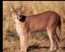
*Caracal U$ 1,100