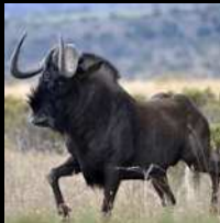
* Black Wildebeest U$ 1,650