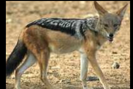
*Jackal U$ 180