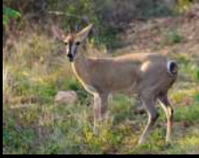
*Duiker U$ 500