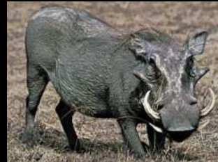
Warthog U$ 650