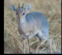
** Damara Dik-Dik U$ 2,450