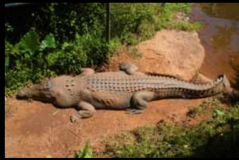
Crocodile U$ 9,500