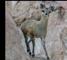
**Klipspringer U$ 2,350