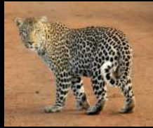
**Leopard U$ 8,000