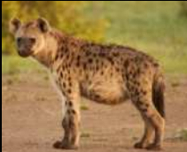
*Hyena (Spotted) U$ 2,950