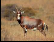
*Blesbok U$ 950