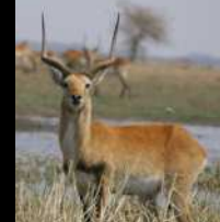
*Red Lechwe U$ 3,250