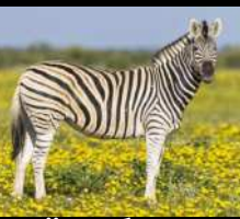
* Zebra (Burchell) U$ 1,350