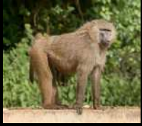
* Baboon U$ 180