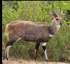
Chobe Bushbuck U$ 3,000