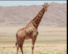
*Giraffe U$ 2,850