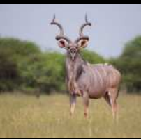
*Kudu (Greater) U$ 2,650