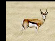
*Springbok U$ 650