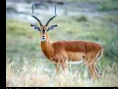
**Black Faced Impala U$ 2,500