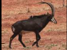
*Sable Antelope U$ 6,500