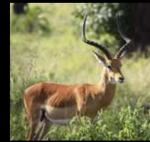
*Common Impala U$ 650