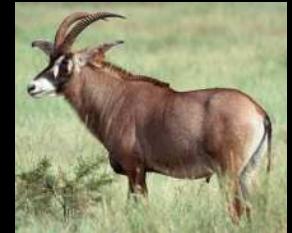
Roan Antelope U$ 12,500