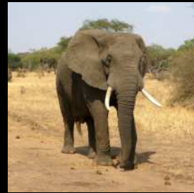
Elephant U$ 39,500