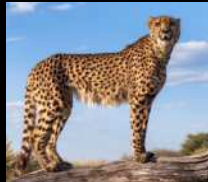
**Cheetah U$ 6,000