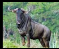
* Blue Wildebeest U$ 1,150