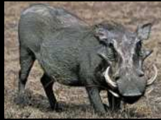
* Warthog U$ 550