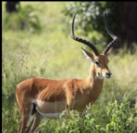
Common Impala U$ 650