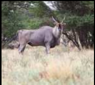
*Cape Eland U$ 2,200