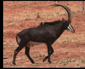
Sable Antelope U$ 9,500