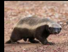
**Honey Badger U$ 1,100