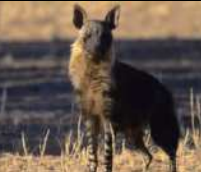
**Hyena (Brown) U$ 2,950