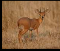
*Steenbok U$ 500