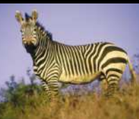
* Zebra (Hartmann) U$ 1,650