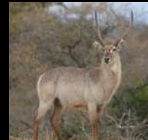
*Waterbuck U$ 2,850