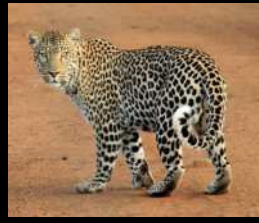
Leopard U$ 12,500