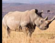
**Rhino White U$ 75,000