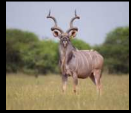
Kudu (Greater) U$ 3,500