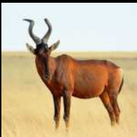
*Red Hartebeest U$ 1,000