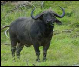
Cape Buffalo U$ 14,500